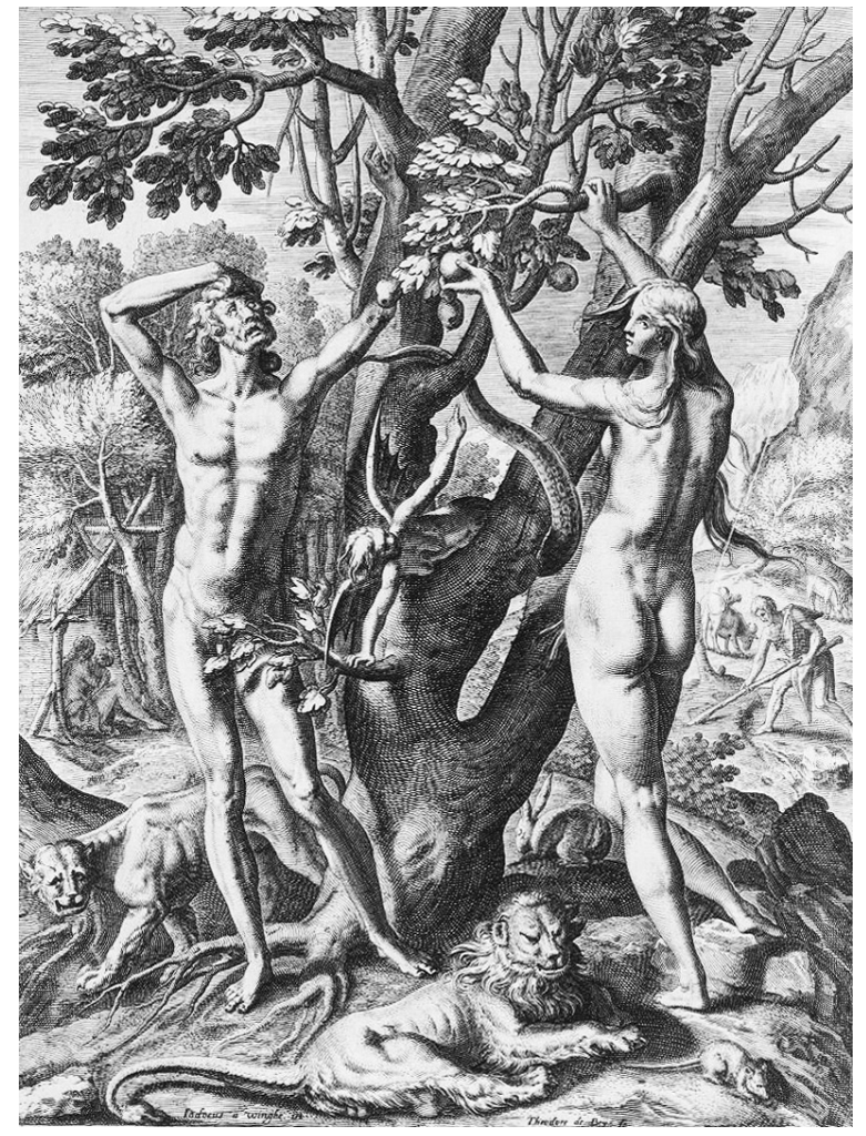
An illustration of Adam and Eve from Thomas Hariot, A Briefe and True Report of the New Found Land of Virginia (London, 1590). Beinecke Rare Book and Manuscript Library, Yale University.

conservative evangelical Protestants and conservative Catholics. For both of these groups, the story of Adam, the inheritance of original sin, and the significance of Adam in a representative capacity